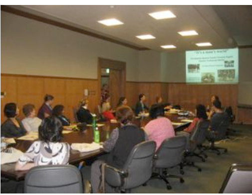
Featured speaker lecture: "It's a man's world: Investigating Japanese female university English teachers' professional identity"