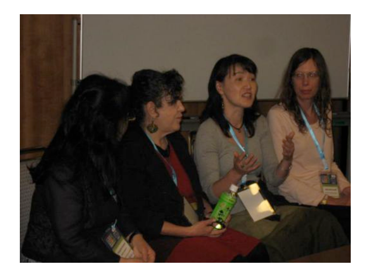
Speakers at the GALE Forum