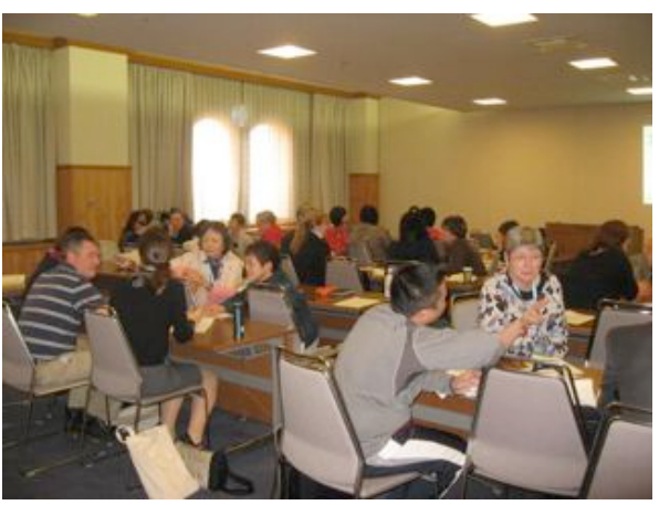
Featured speaker workshop: "Gender Counts: Women in Japanese Higher Education"