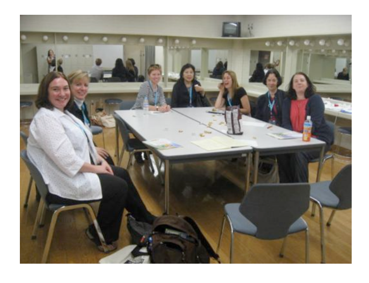
Decisions being made at the GALE Annual General Meeting